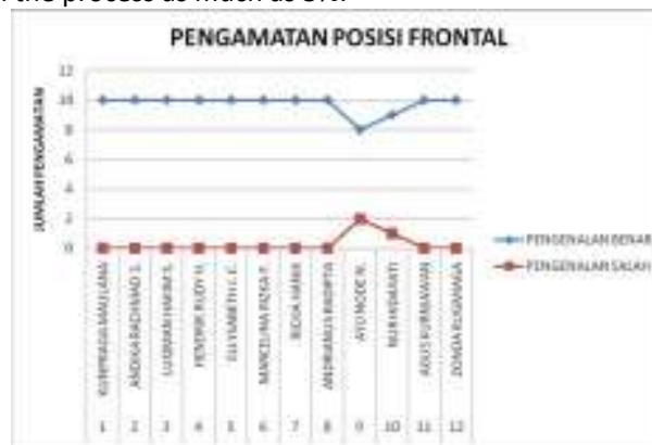
Figure 2: Frontal position observation result

The percentage of success with face recognition for frontal position with a total observation time of 120 observations of 12 students (Figure 2) with each student as much as 10 times. It obtained a total of 117 correct and 3 incorrect facial recognitions. The percentage of success is 97% correct recognitions and recognition failure in the process as much as 3%.