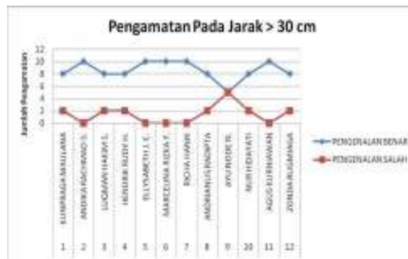
Figure 4: Observation result with \pm 30 cm distance

The success rate of face recognition with variable distance > 30 cm, as shown in Figure 4, gave unsatisfied results, the percentage of correct recognition value that is 86% while the fail ones are quite low at 14%. Tests conducted with 12 students and each student was observed 10 times.