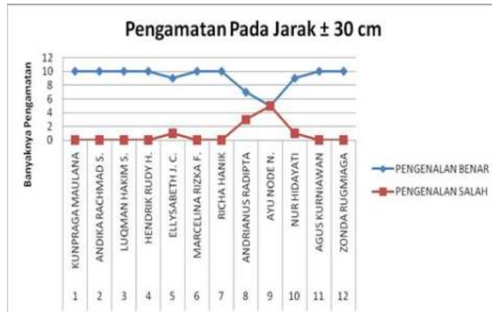
Figure 3: Observation result with \pm 30 cm distance

The success rate of face recognition with a variable range of \pm 30 cm gave a very good result; the percentage of correct recognition value is very high around 92% while the fail recognition is quite low at 8%. A test was conducted on 12 students (Figure 3) and each student was observed 10 times.